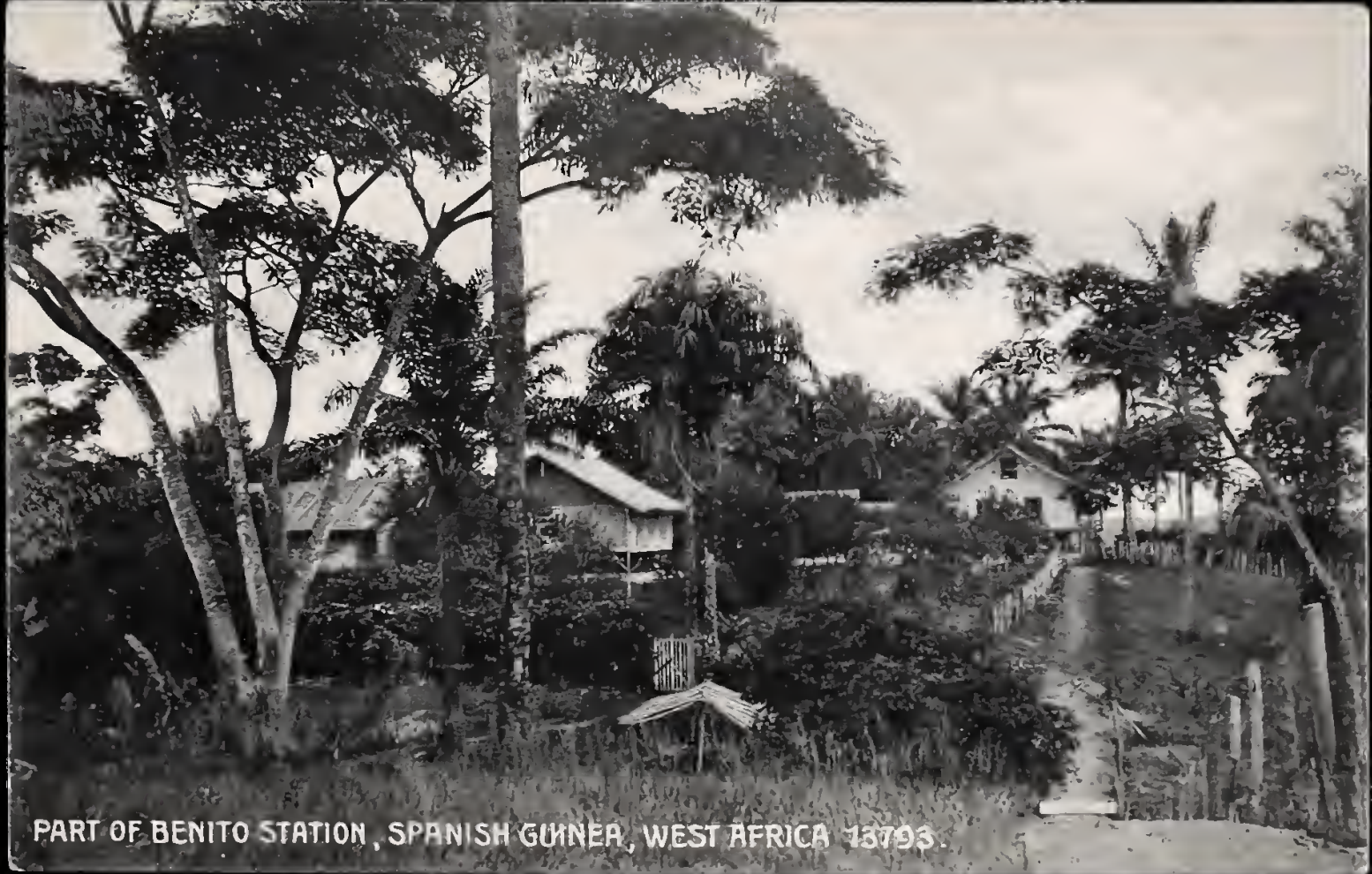
PART OF BENITO STATION, SPANISH GUINEA, WEST AFRICA 1879.